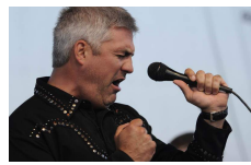
Flora-Bama Shindig On The Sand Friday