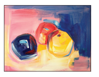
Square Apples ©2012, by Terre Britton www.terrebritton.com