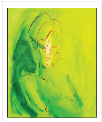
"Nettles" ©2013, by Terre Britton www.terrebritton.com