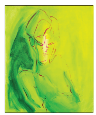
"Nettles" ©2013, by Terre Britton www.terrebritton.com