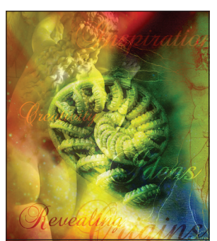
"Creative Flux" ©2011, by Terre Britton www.terrebritton.com